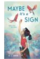
Maybe it's a sign by E.L. Shen